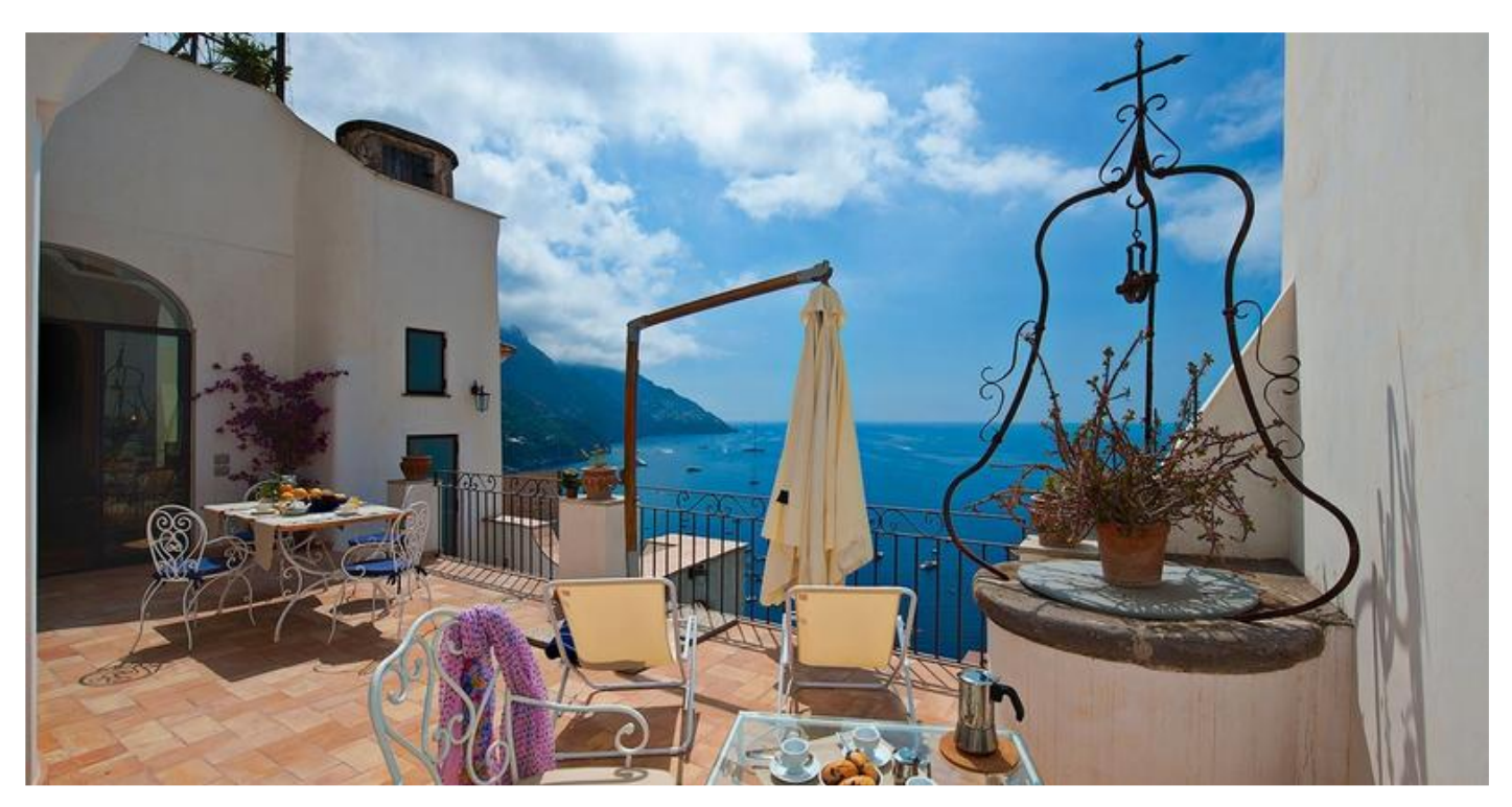
6 guests | 3 rooms | 3 baths