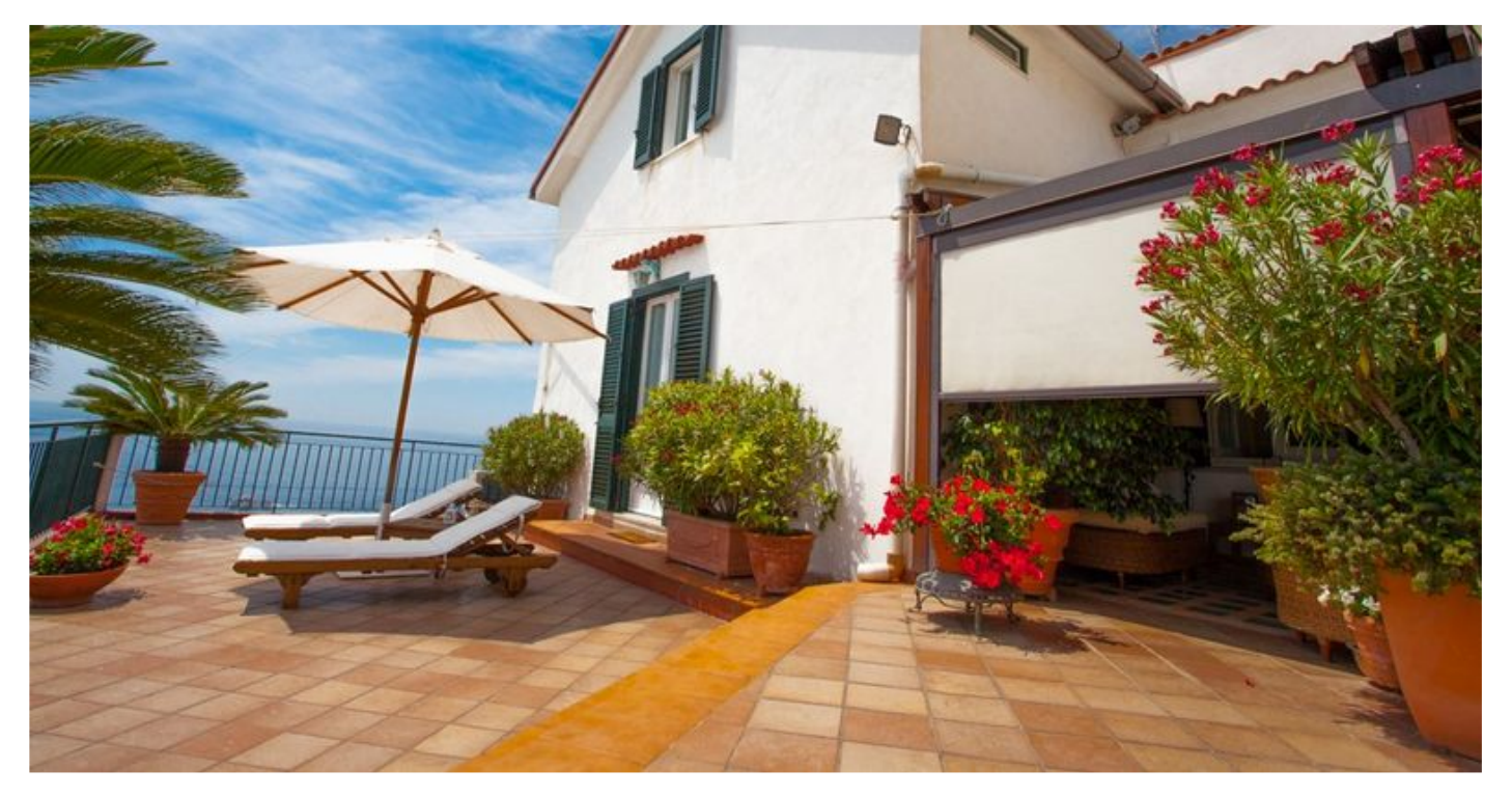
6 guests | 3 rooms | 3 baths