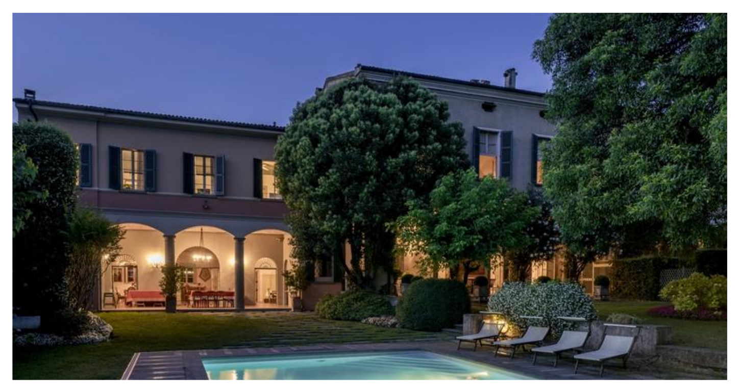
23 guests | 8 rooms | 7 baths