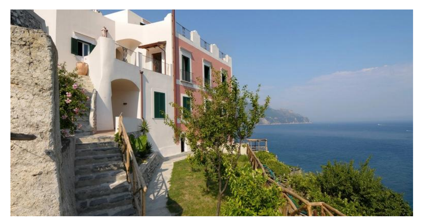
24 guests | 12 rooms | 12 baths