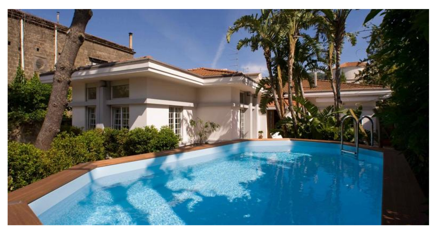
12 guests | 6 rooms | 6 baths