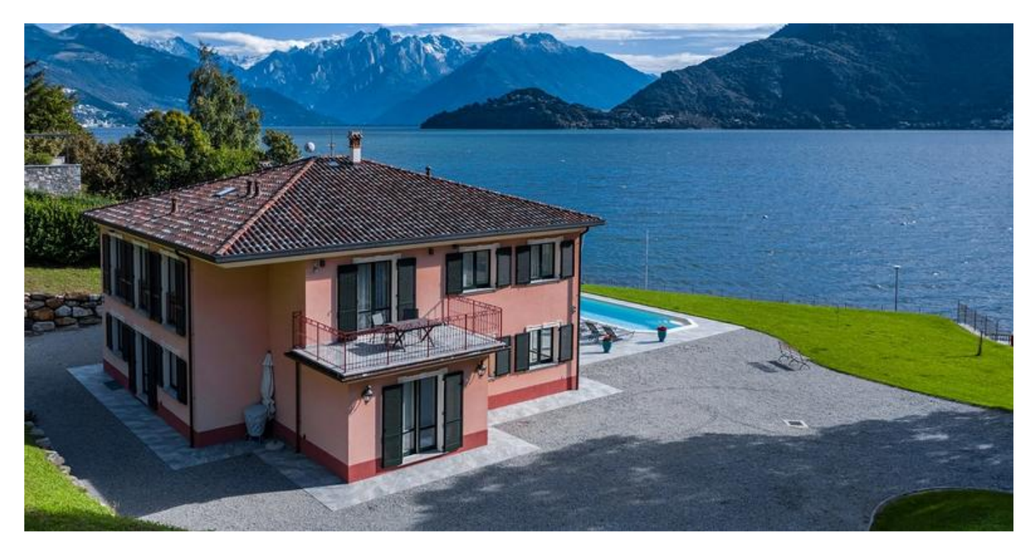
12 guests | 6 rooms | 7 baths