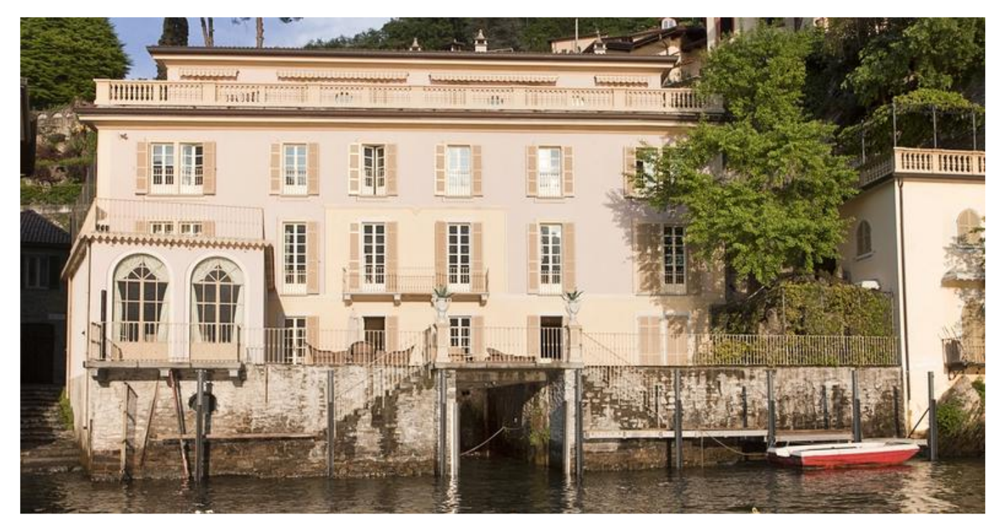
14 guests | 7 rooms | 7 baths