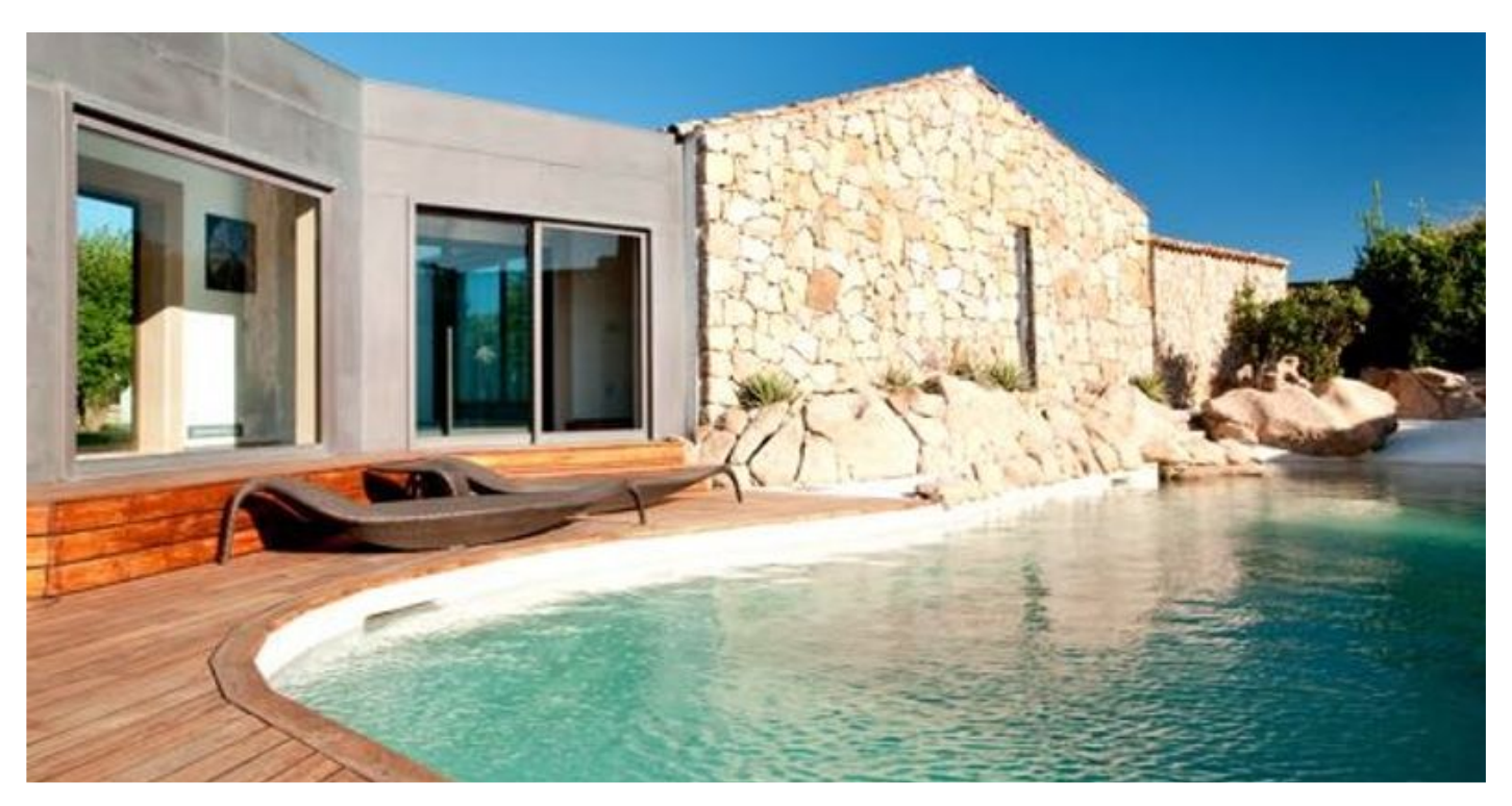
14 guests | 6 rooms | 7 baths