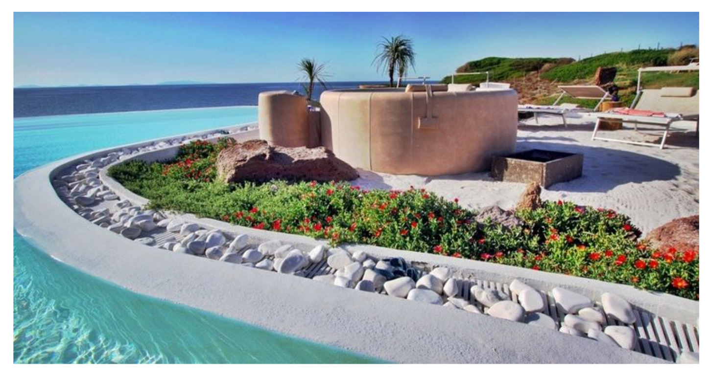
10 guests | 5 rooms | 5 baths