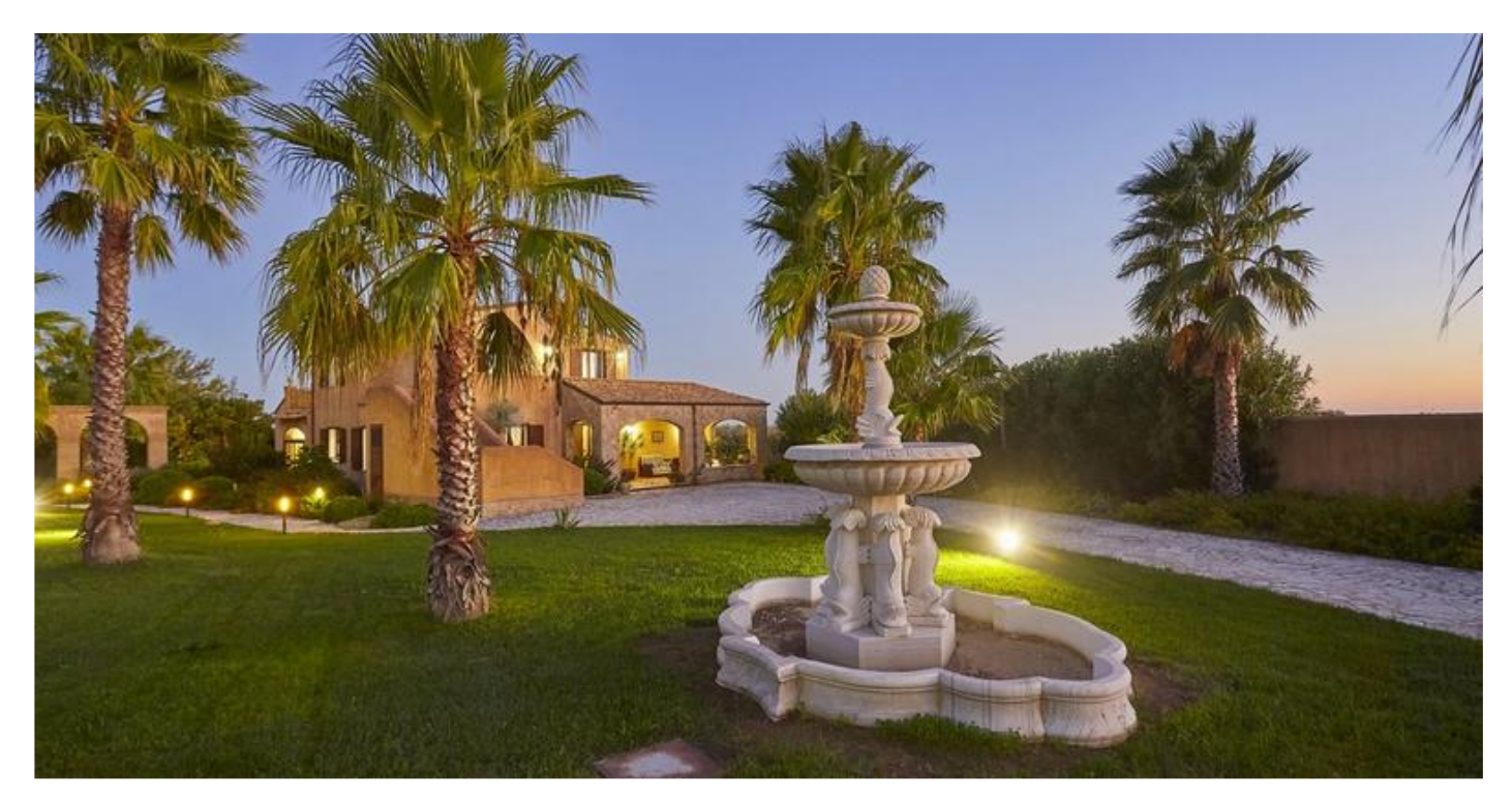
8 guests | 4 rooms | 2 baths